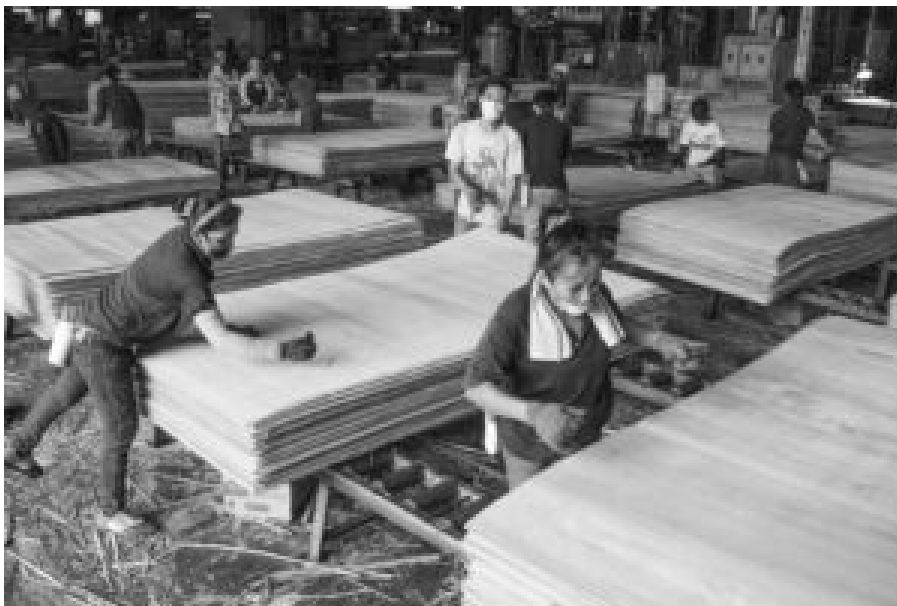
Plywood production in a factory of the Veracity Corporation in the Malaysian state of Sabah: Most workers come from Eastern Indonesia.

Authoritarian control and the suppression of labour movements and unions were also hallmarks of colonial administration. The post-colonial continuity of these conditions is evident in today’s laws: following uprisings by forcibly displaced and immigrant workers, the British regime in the 1940s enacted ordinances that granted unlimited powers to ban unions. Union leaders deemed „communist sympathizers“ were executed.