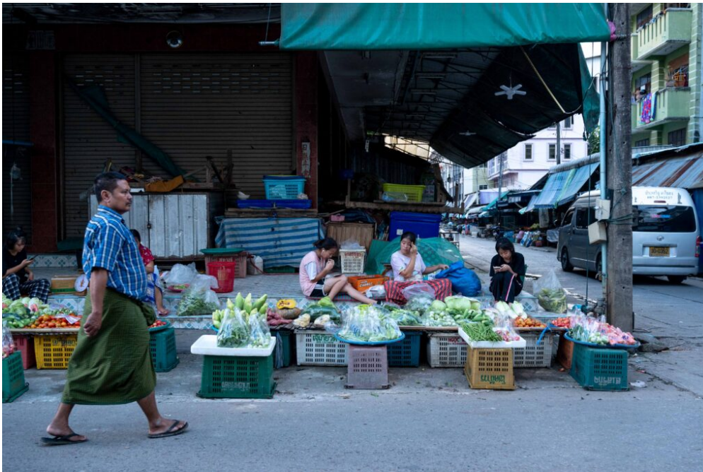
Everyday life at the local market in Mae Sot, Thailand