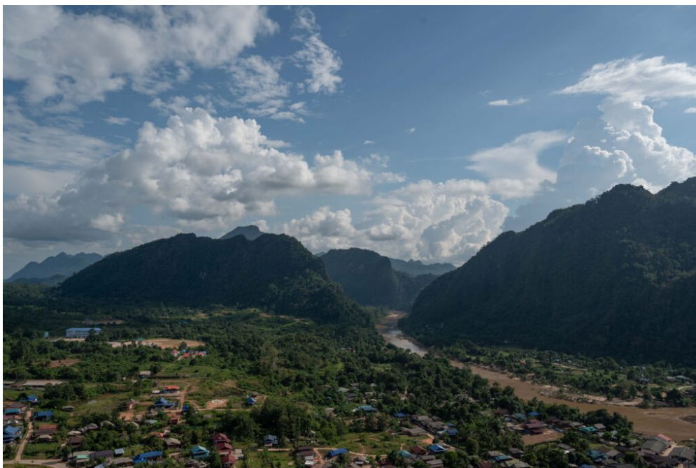
Looking across the Moei River where Thailand meets Myanmar