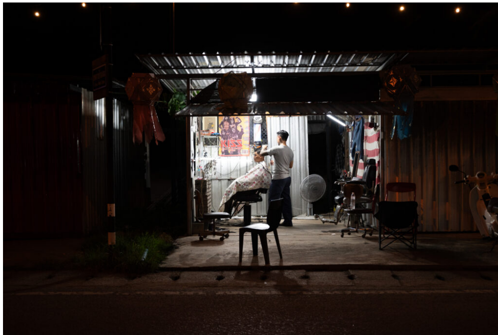
A barber cuts a man's hair in the border town of Mae Sariang, Thailand