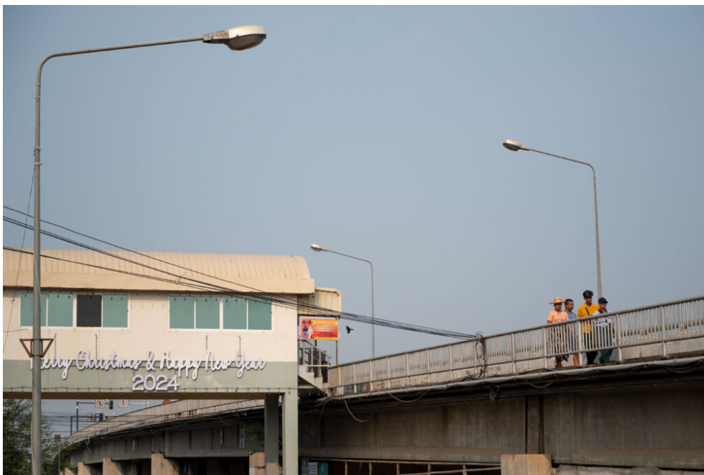
People crossing Friendship Bridge between Thailand and Myanmar